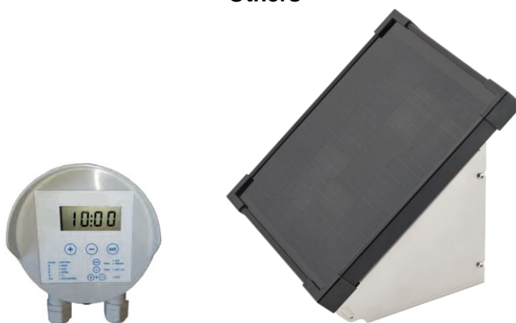
Control timer und solar module