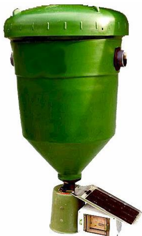
without spreader (left) with spreader (right)