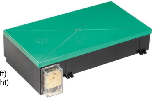
for 3 kg/12-24 h (left) for 5 kg/12-24 h (right)